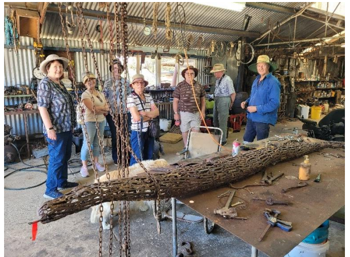
Boort, Victoria, Spanner Man Workshop "Amazing what you can do with a collection of spanners"