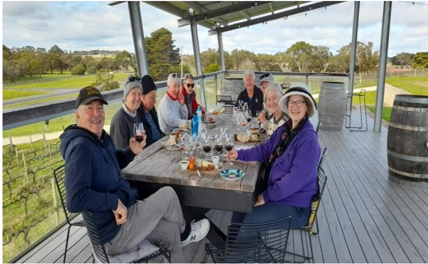
Cape Jaffa Winery

T hirteen members travelling in five vehicles participated in the 11-day Meningie to Port MacDonnell trip in September. The windy and rather cold weather did not deter exploration of tracks along the Coorong and around Lake Albert on the first day, and in 42 Mile Crossing National Park the following day. The trip continued further south to Kingston for the next night, with a visit to Cape Jaffa Winery for lunch of sumptuous platters and wine tasting. Next stop was Robe for two nights, where the group was joined by several other members. A warm sunny day was welcome for travel in Little Dip Conservation Park on bush and beach tracks, and to Nora Creina Beach. Dinner was enjoyed in the Caledonian Hotel that