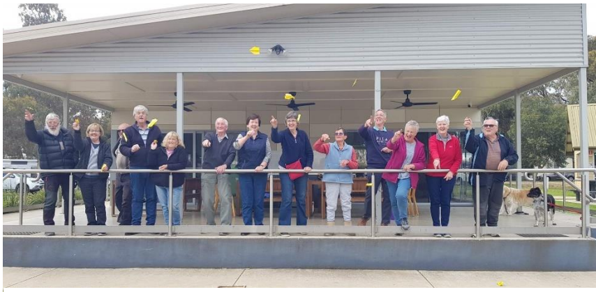
Bingo cards were made into paper planes and a contest to throw the furthest.