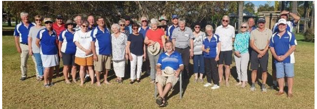
RASA Golfers on the Riverland trip.

The Golf Group will celebrate another successful year with Christmas lunch and annual prize giving at the Lighthouse Wharf Hotel, Port Adelaide on Wednesday 6 December. Monday competitions were played on six different courses this year but this will be expanding to 8 (three new ones) in 2024. A country trip to the Riverland, staying at the Berri course and playing both Berri and Barmera courses, was enjoyed by 23 golfers. Seven partners also attended and they went shopping, visited the Rose Gardens, the 23 rd Street Distillery, and a winery in Lyrup, and joined the golfers for Happy Hour and meals. In 2024 the Group is planning a trip to Goolwa and Victor Harbour.