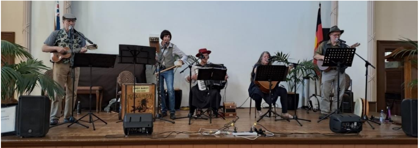
Retire Active Bushband performing at the North Adelaide Community Centre

R etire Active SA Bushband provided an entertaining hour of songs on Friday 29 September at the North Adelaide Community Centre.