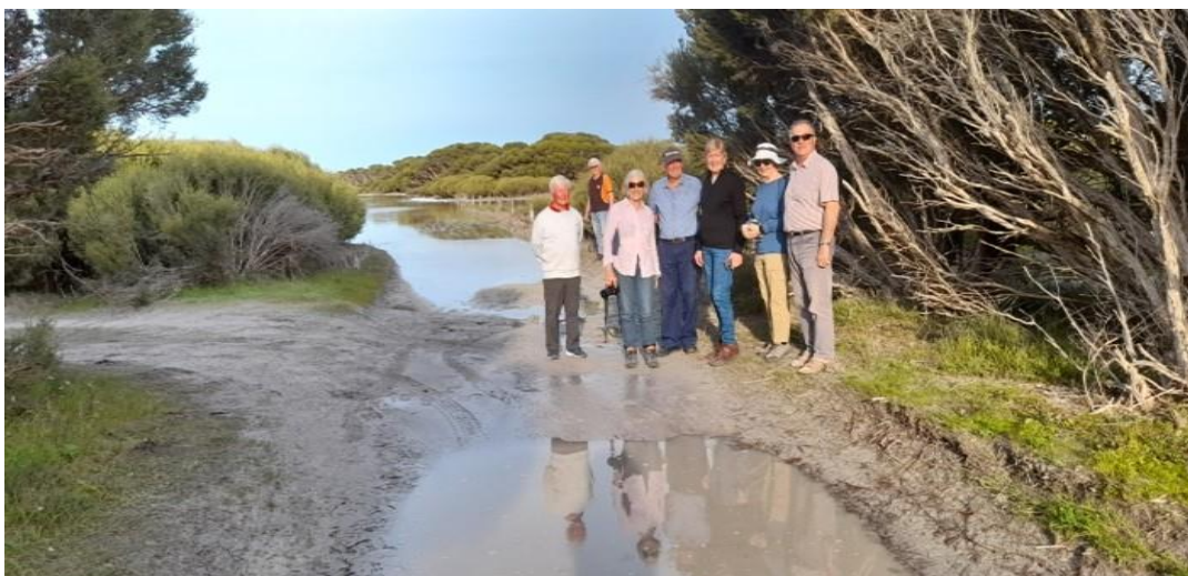
4WD Group at Lake George