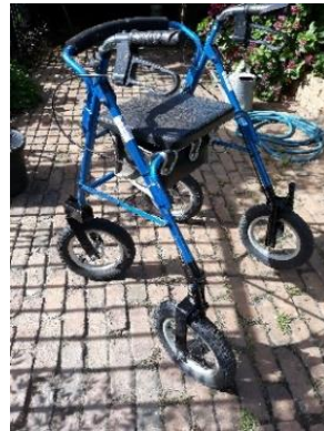
All Terrain modification to Walker

No other organisation provides what TADSA provides and we are proud to be the leading customization service in South Australia, ensuring fit for purpose, fit for life solutions that achieve what the client set out to achieve.