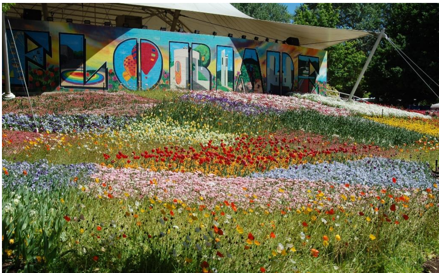
Floriade Flower Festival, Canberra