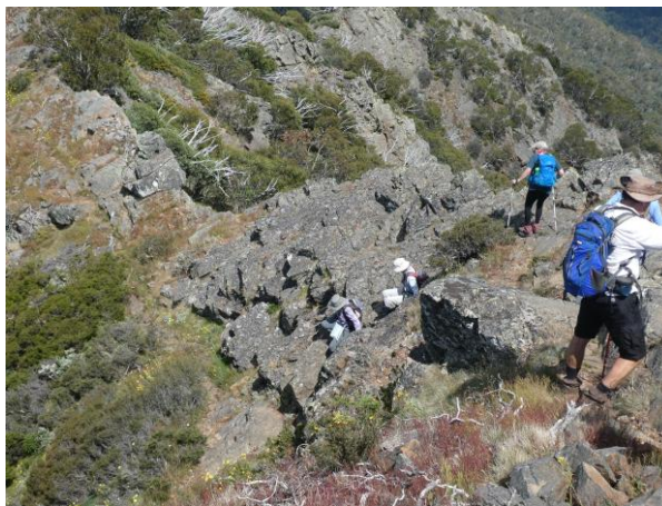
B Walkers on a rocky descent