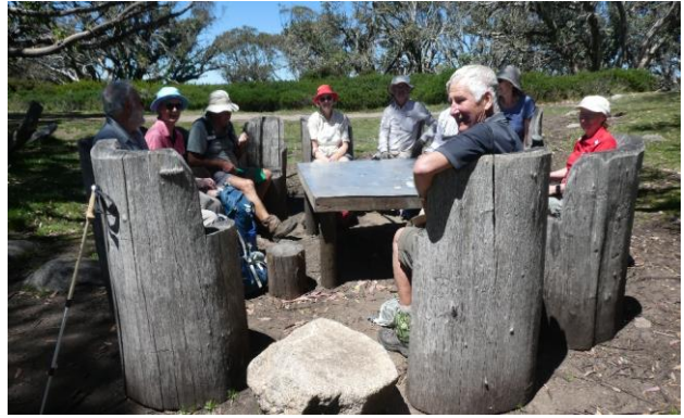
A/B Walkers resting