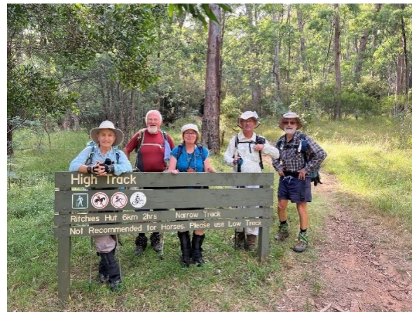
A Walkers on the High track