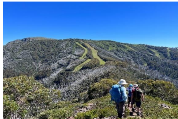
A long ridgeline ahead for A Walkers