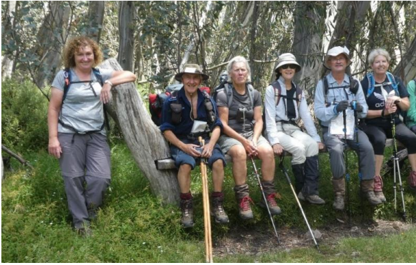
B/C Walkers resting