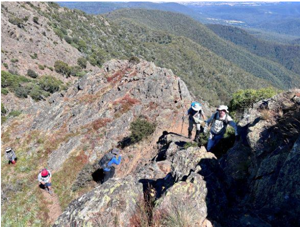
A Walkers on a rocky ascent