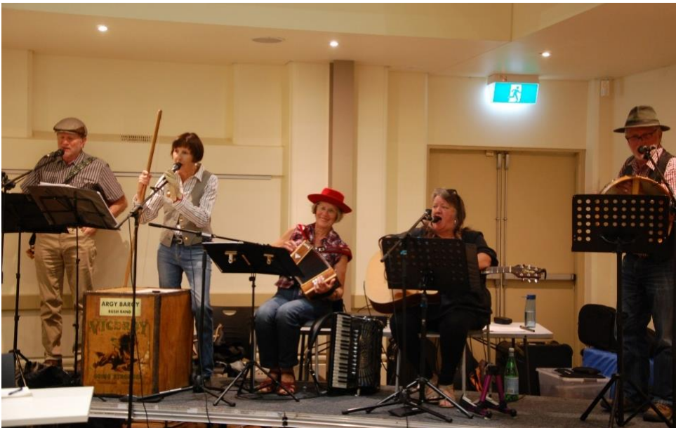
The Argy Bargy Bush Band performing at the Bushwalkers AGM