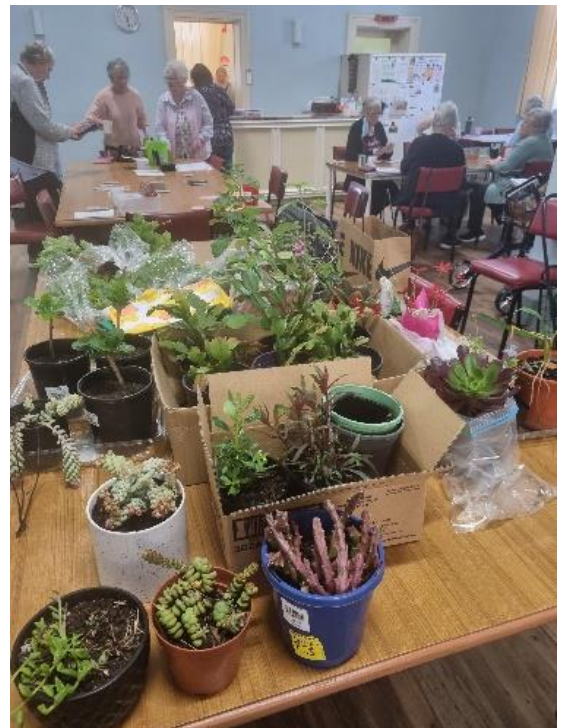
Swap a Plant Day

Special celebrations were enjoyed for Easter, Anzac Day, the Coronation and Melbourne Cup and several lunches at local establishments. The members are very enthusiastic participants and love dressing up for special occasions. Winter was launched with a soup day and another week was pie floater day. Spring was welcomed with a "Swap a Plant" event that was very popular.