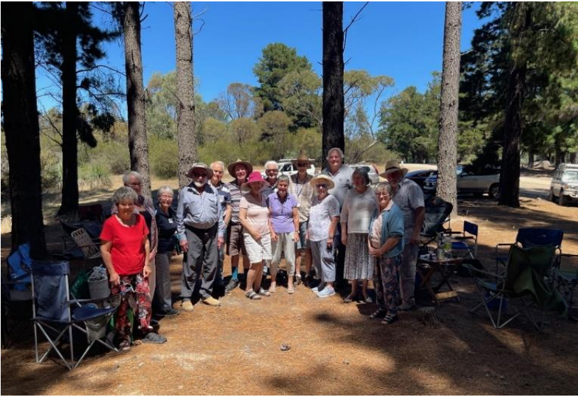
The Rocky Crossing picnic spot

The group finished up in the Forreston area at a shady picnic spot under the pines at Rocky Crossing.